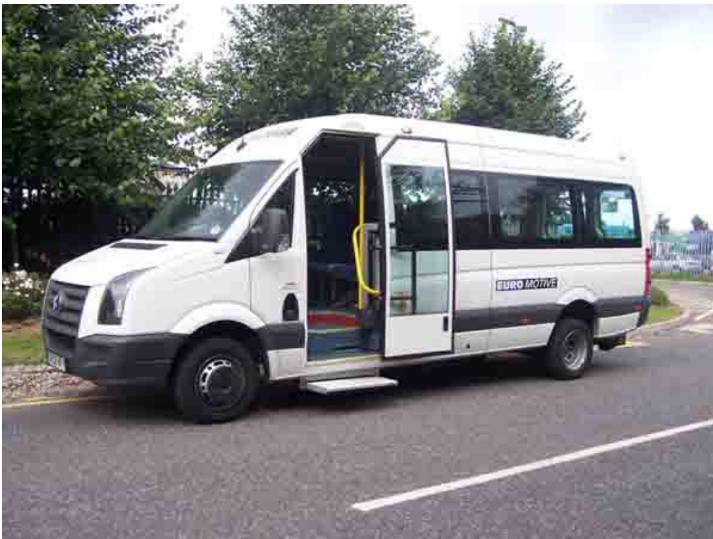
The East Surrey Rural Transport Partnership's newest vehicle is seen above. This continues to help people in the more isolated villages in the south of Mole Valley and below the Mayor of Waverly opens St Martins Hall, Lower Bourne