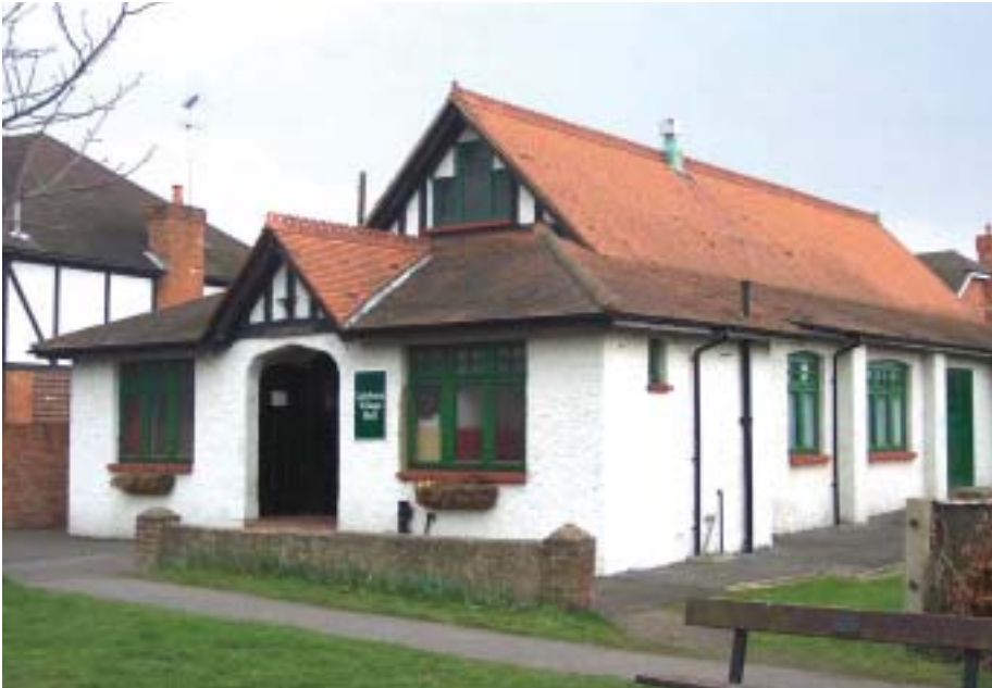
Laleham Village Hall